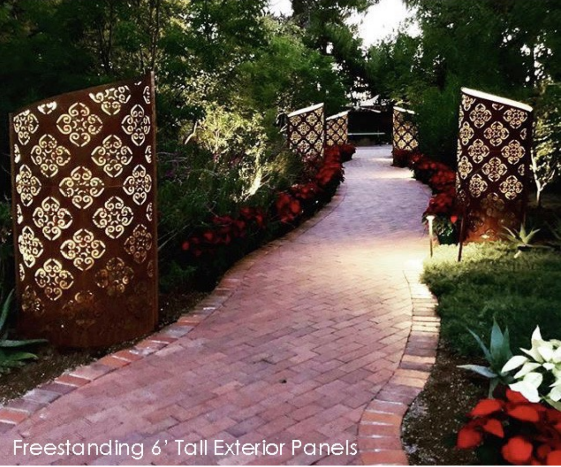
Freestanding 6' Tall Exterior Panels