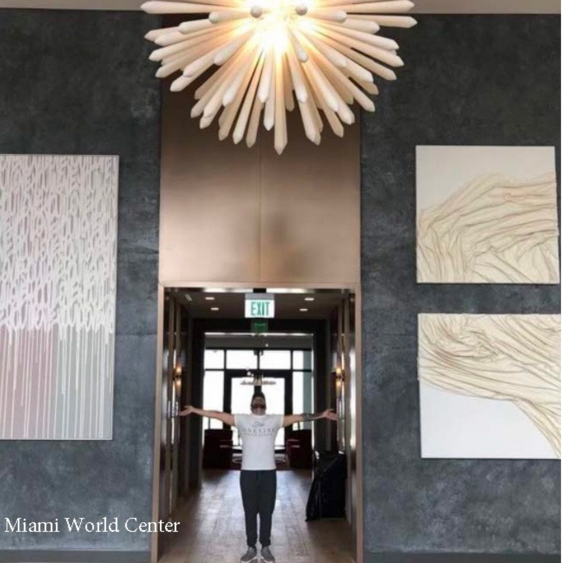
Miami World Center