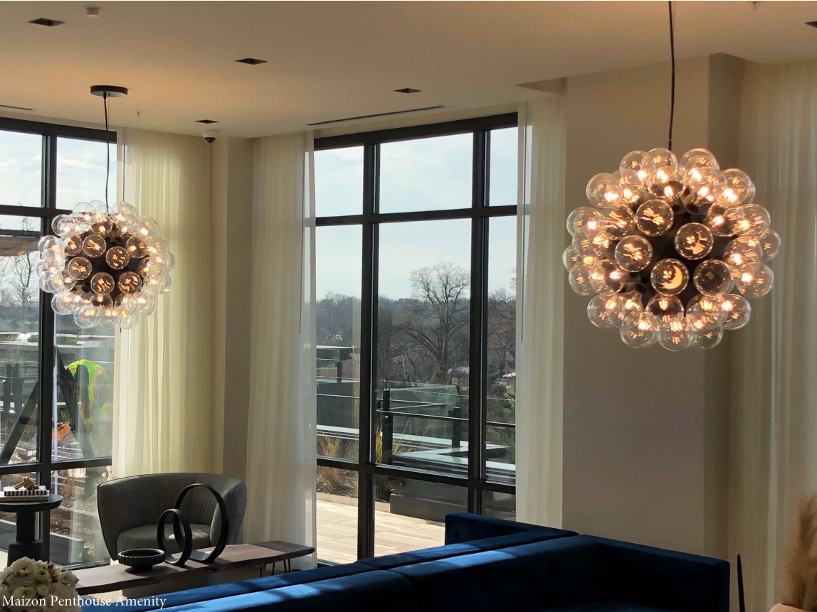
Maizon Penthouse Amenity